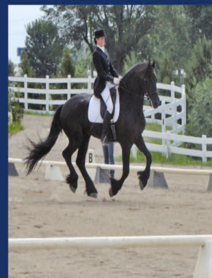
Maraus, 5-year-old Friesian stallion. Trained by La Riata Ranch. Training level champion at his first show out.

Call us at 712-778-5295 (Barn) or 402-598-7475 (Cell) or Visit us at www.lariataranch.com