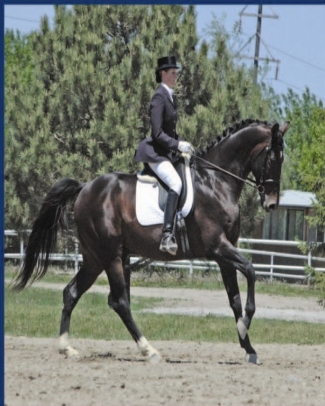
Der Graf, RPSI Stallion Donnerhall x Pik König Trained by LRR and standing at La Riata Ranch