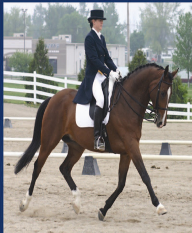
Ventura, started in 2002 by La Riata Ranch Champion FEI 5-year-old 2004 WBFSH Selection Trials, Competed YH Championships 2004